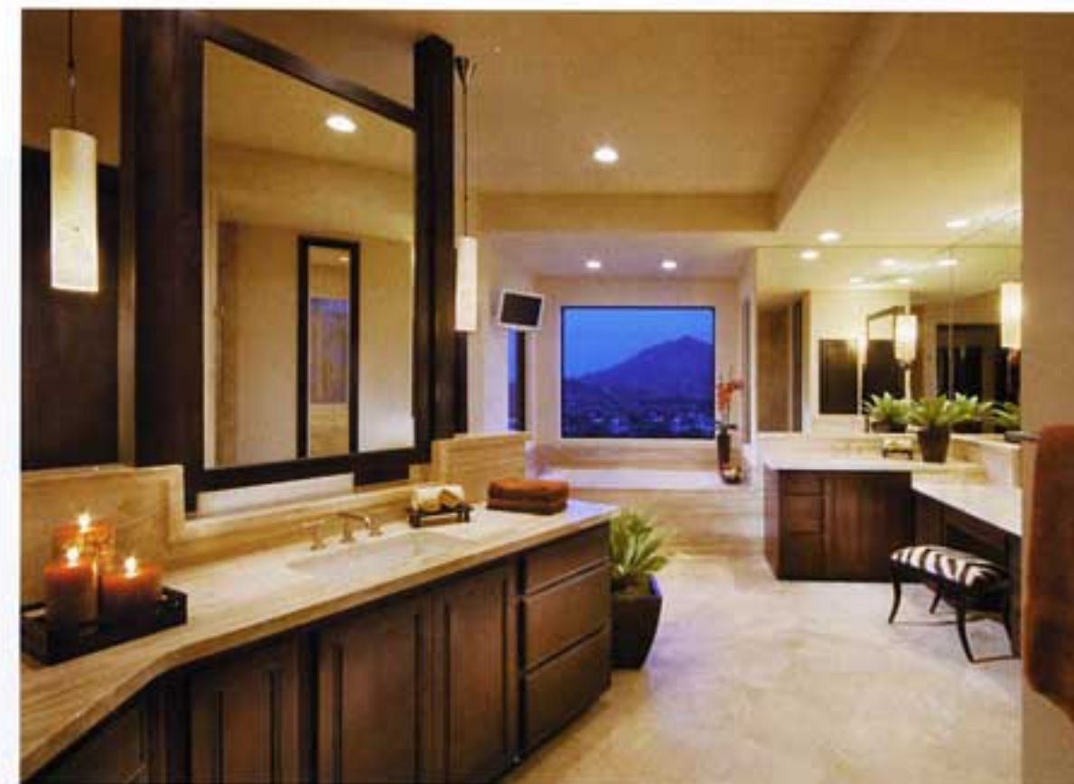
Above: A splash of yellow enlivens the family room, where a collection of tribal art is displayed. Opposite: An angled vanity and floating mirror lead from the master bedroom into the bath.

With a thoughtful approach, Ownby created an elegant, understated interior, rich in details without resorting to fussiness.